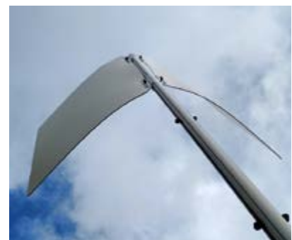
SignTrax Signs tested in strong winds

To achieve the level of durability required for exterior use, SignTrax Signs are reinforced with high-strength pultruded fibreglass rods, embedded into the structure of the sign. This feature adds strength yet allows the sign to flex and spill the wind, reducing wind loading. Large light-weight signs can be used without risk of damage to the sign, the support structure or the SignTrax system.