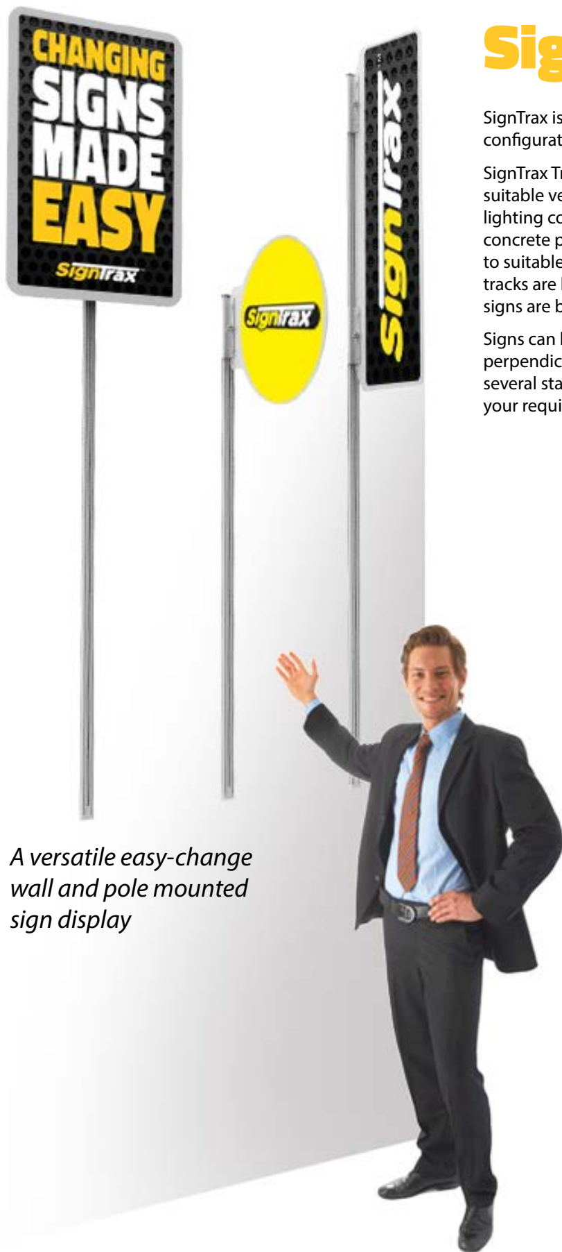
A versatile easy-change wall and pole mounted sign display